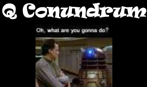
PLUNGE me to death?